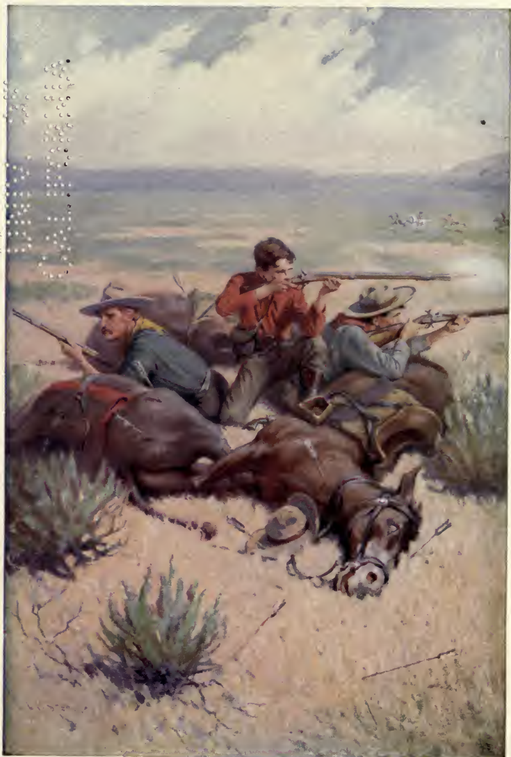
AS LAME BUFFALO HAD SAID, THE "LITTLE ONE" SHOT THE STRAIGHTEST OF ANY